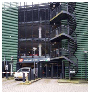
Back side of garage