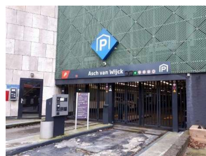
Front side of garage

To the Nobian office: If not parked on the ground floor, take the elevator or stairs to the ground floor, and leave the parking garage by foot through the door next to the front entrance. Once outside, go to the right. You are then in front of the Hoek3 building, the entrance is approx. 50 meters away.