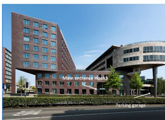
Front side of the Hoek3 building